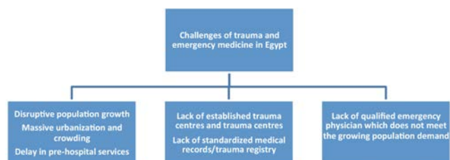
Figure 3. Challenges of the trauma system in Egypt.