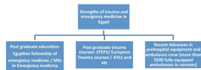
Figure 2. Strengths of trauma and emergency medicine in Egypt. MSc, master of sciences; STEPS, sequential trauma emergency/education programs; ATLS, advanced trauma life support.