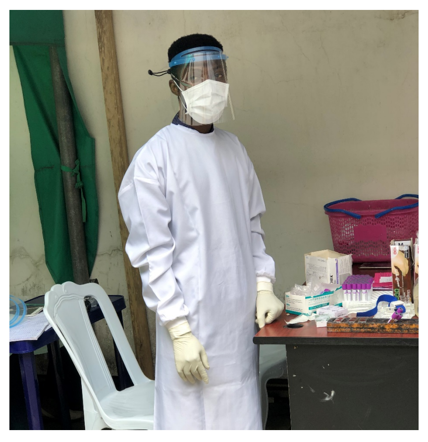
FIGURE 2: Standard PPE ensemble for staff with patient contact after reopening included medical masks, launderable gown and gloves. Respiratory masks, not shown, were used by staff engaged in high risk operations.