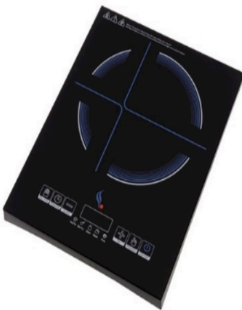
Intervention stove 3: Electric Induction stove