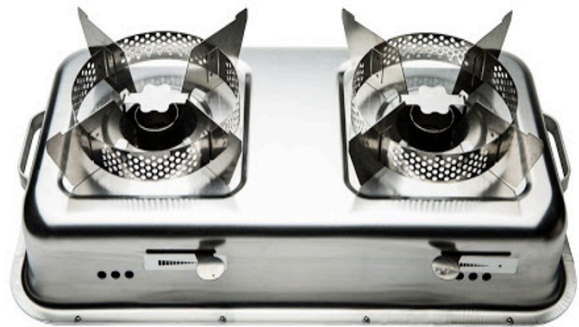
Intervention stove 2: Ethanol stove