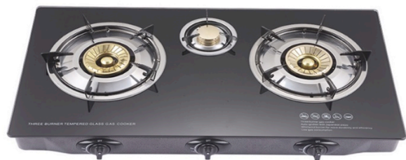
FIGURE 1: Intervention Stoves.