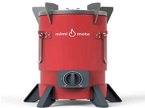
Intervention stove 1: Mimi Moto stove