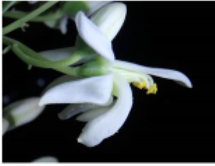
Figure 4. Moringa oleifera flower