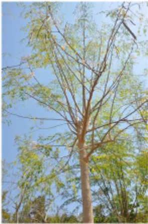
Figure 2. Moringa oleifera tree