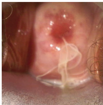
Figure 3. A Slide showing the edematous and reddened cervix.

This case was a young woman in the reproductive age group who desired to have more children. This incidental finding and treatment of this index case has probably contributed to preventing the complications of genital HSV infection viz a viz the possibility of sexual transmission of the disease, as well as perinatal transmission with emergence of congenital malformation in infants of infected mothers. This case also illustrates the importance of effective routine Pap smear for sexually active women.